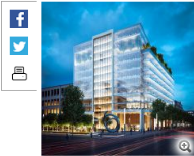
CGI of 1 Bankmore Square

The development of a major new office scheme at the Movie House cinema site in Belfast City Centre will go to public consultation on the 6th & 7th February. Subject to planning approval, 'One Bankmore Square' will become the largest single office building in Northern Ireland. The Richland Group is proposing to develop the 255,000 square foot Grade A office scheme – complete with ground floor space for ancillary cafe, retail and leisure uses – at Bankmore Square on the Dublin Road. Each single floor plate will comprise of 25,000 square feet of net useable space – a layout that proves popular with office occupiers.